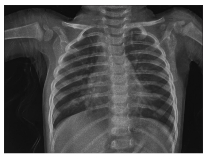
Figure 2: Chest X-ray posteroanterior view showing peribronchial opacities suggestive of microaspirations.

allergen in lentil allergy. This was supported by its high recognition rate (68%) by patient sera and its ability to inhibit (64%) IgE binding to commercial lentil allergen extracts.<sup>[6]</sup> The second allergen identified in boiled lentils is protein H, a 66 kDa component that binds to IgE. Purified protein H was recognized by 41% of patient sera and inhibited IgE binding to commercial lentil extracts by 45%. Boiling lentils appears to break down existing allergens into smaller fragments, which may have stronger allergenic properties.<sup>[7]</sup> The most likely explanation for these allergic reactions is IgE-mediated hypersensitivity. This occurs when a person's immune system becomes sensitized to a food after eating it and then reacts to it through an IgE-mediated response.<sup>[8]</sup>